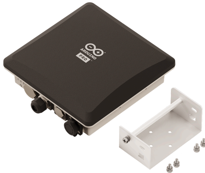
WisGate Edge Pro Components