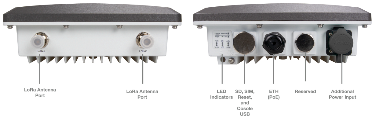
WisGate Edge Pro Interface (by RAKWireless™)

For comprehensive instructions on gateway installation, please refer to the installation documentation.